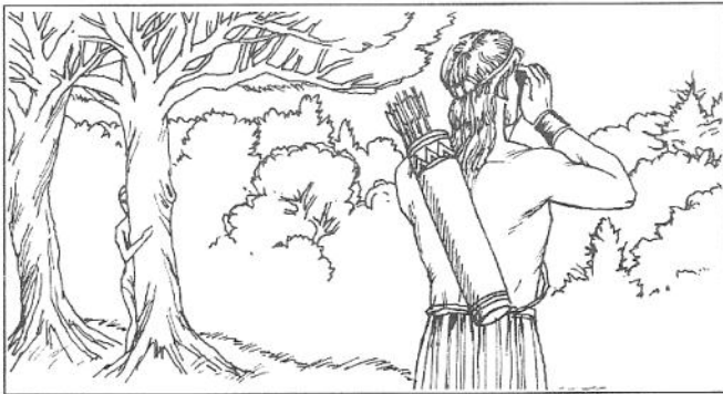
C Narcissus clāmat. Ēchō respondet.