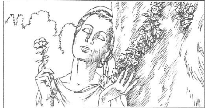
B Ēchō Narcissum amat. ēheu! ēheu!