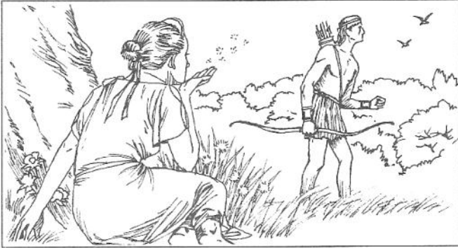
A Ēchō nympha est in silvā. Narcissus est vĕnātor.